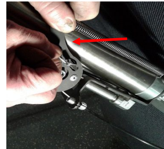
Rotating lever plate to remove cable end