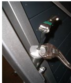
(fig 1) Holding reservoir top while loosening plug