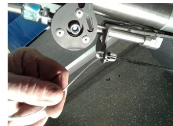
Aligning cable adjuster nut and bracket to remove cable and housing